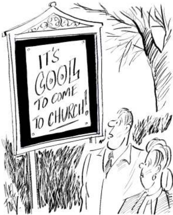
"It's either an appeal to youth culture or the heating's playing up again"